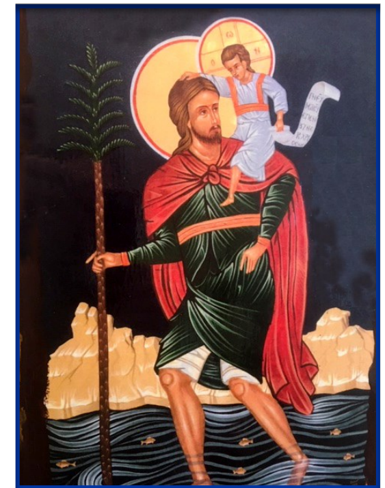
St. Andrew (Verona) & St. William (Paoli)

Meet Christ. Follow Christ. Bear Christ.